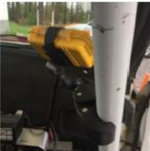
On the roll cage along the A-pillar

The Yellow Cellular Device must be secured with the supplied RAM mount clamped to a component of the roll cage such that the arm of the mount places the device as close as possible to a window with the red label on the device easily readable from the outside.