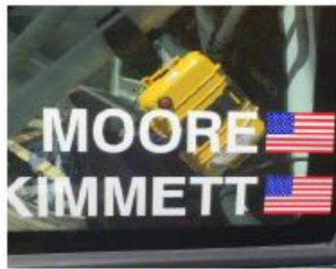
On a roll cage main hoop, connecting member or backstay