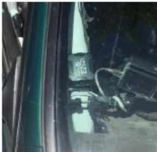
On the roll cage along the A-pillar

The Black Satellite Device must be secured with the supplied Velcro or a zip tie such that the EZTrak label is facing the sky through the windshield or the rear window.