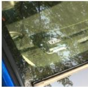
On the dashboard