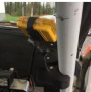
On the roll cage along the A-pillar

The Yellow Cellular Device must be secured with the supplied RAM mount clamped to a component of the roll cage such that the arm of the mount places the device as close as possible to a window with the red label on the device easily readable from the outside.