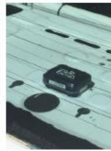
On the rear package shelf

The Yellow Cellular Device must be secured with the supplied RAM mount clamped to a component of the roll cage such that the arm of the mount places the device as close as possible to a window with the red label on the device easily readable from the outside.